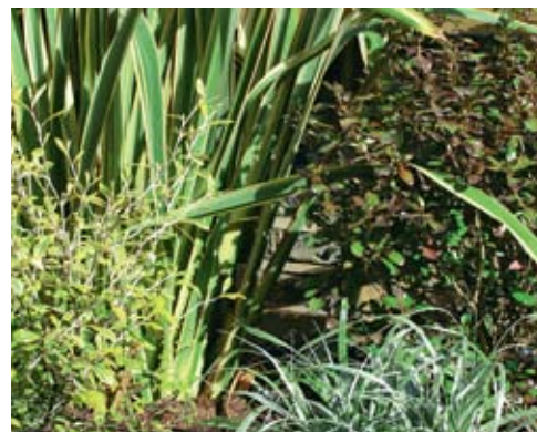
Right: The purplish-red coprosma provides contrast in the mainly green and silver scheme