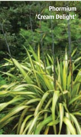
Phormium 'Cream Delight'

Astelia 'Silver Mound' Astelia chathamica Coprosma 'Karo Red' Corokia x virgata 'Red Wonder' Corokia x virgata 'Sunsplash' Laurus nobilis Leptospermum scoparium 'Burgundy Queen' Libertia ixiioides Libertia peregrinans 'Gold Leaf' Lophomyrtus x ralphii 'Red Dragon' Myosotidium hortensia Phormium cookianum subsp. hookeri 'Cream Delight' Phormium tenax Pittosporum tobira Prostanthera cuneata Pseudopanax 'Cyril Watson' Rosmarinus officinalis Salvia officinalis Thymus vulgaris Uncinia uncinata rubra